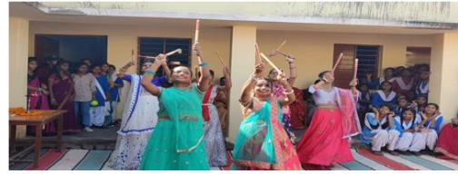
PHOTOGRAPHS OF THE EVENT