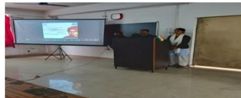
PHOTOGRAPHS OF THE EVENT