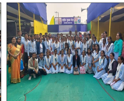
Visit to Book Fair