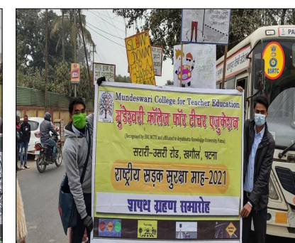
Road Safety Awareness – 1