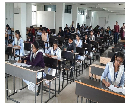
College Internal Exam