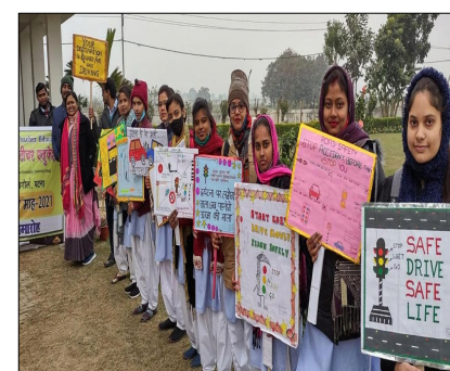
Road Safety Awareness Month