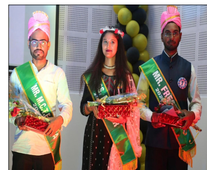
Fresher & Farewell